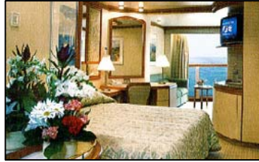
Private Balcony Cabin AC