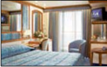
Private Balcony Cabin BD